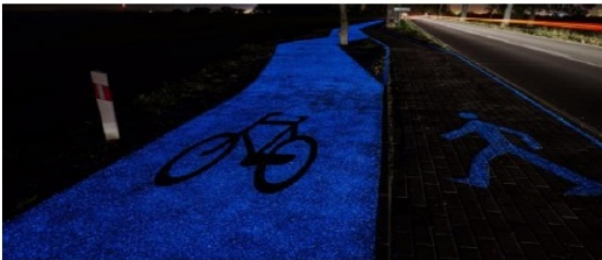
Glow-in-the-dark bike paths